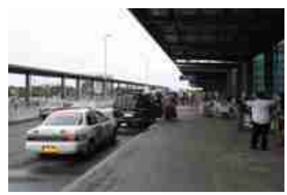
NAIA Terminal 3view