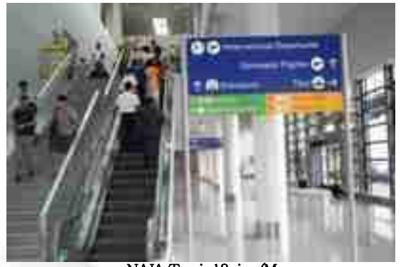
NAIA Terminal 3 view (Mo ving to Domestic)