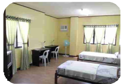
2 person's room