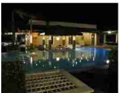
L-Fisher Hotel Swimming Pool