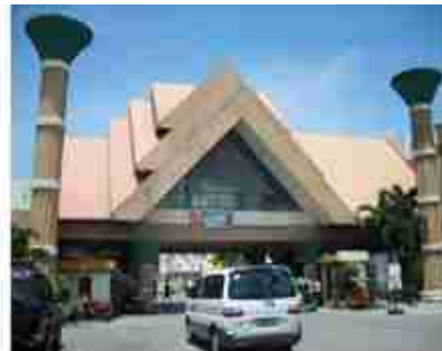
Lopues East Shopping Mall