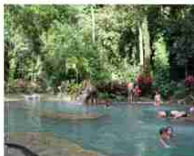
Mambukal Hot Spring