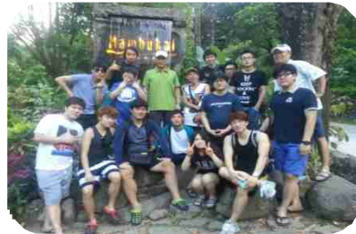
Activity : Mambukal hot-spring trip