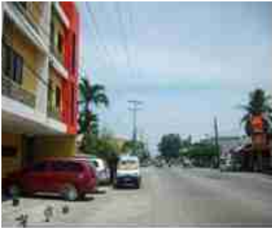
East Road from ILP