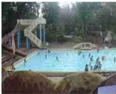
Sta. Fe Resort (10mins on foot)