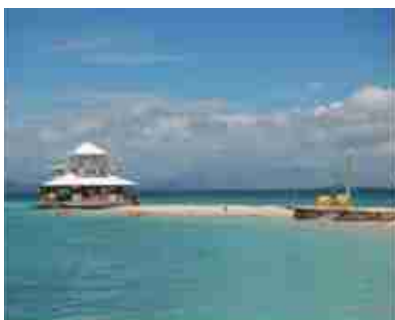
Jomabo Beach near Bacolod