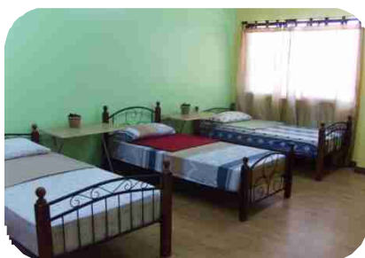
3 person's room