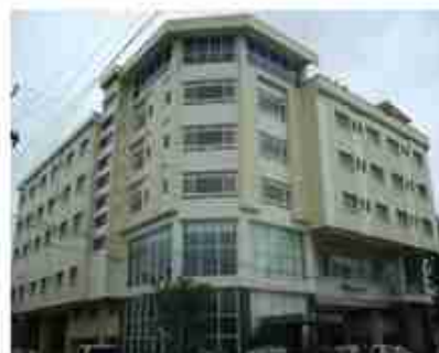
East View Hotel (3mins on foot)