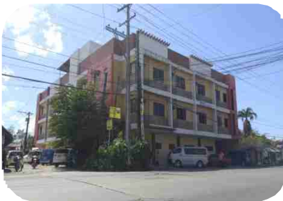
ILP English Academy