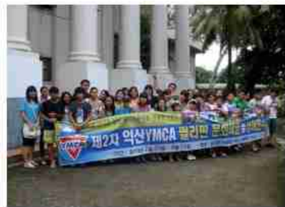
Field Activity : Museum