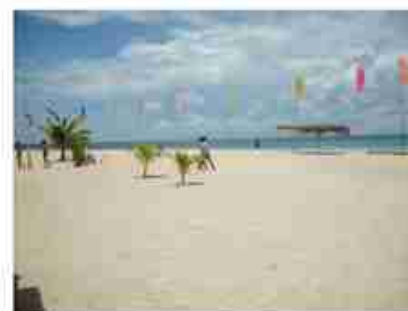
Lakawon Beach near Bacolod