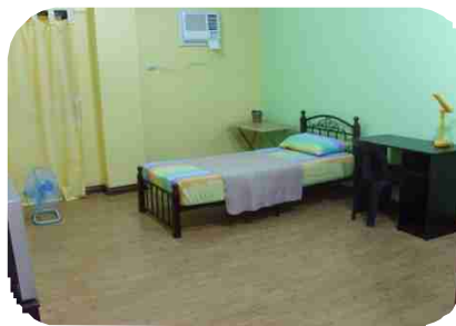
1 person's room