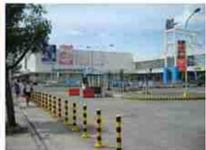
SM Shopping Mall