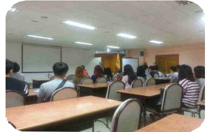
TESOL Entrance Ceremony & O.T