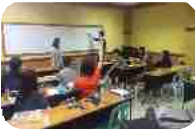
TESOL Class in Local University