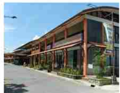
Resto-Complex (3mins on foot)