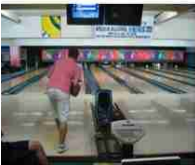
Bowling Center (3mins on foot)