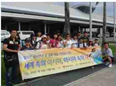
Arrival in Bacolod

ILP has been handing not only YMCA junior but also different Group Overseas English Training since Our school was founded. We also offer various activities suitable for our Junior students including the understanding of Philippine culture and many physical activities like badminton, bowling, swimming, and golf.