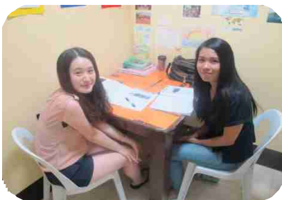
1 : 1 Classroom