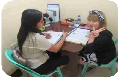
One on one Class in ILP