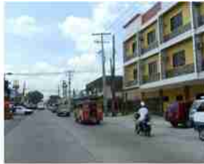
West Road from ILP