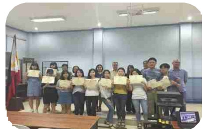
TESOL Graduation Ceremony