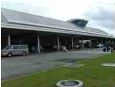
Bacolod New Airport

Though the Philippines is composed of many islands and big cities like Manila, Cebu, etc., The Environment is not healthy for people because of its pollution and heavy traffic. However, Bacolod is simple, naive, laid-back, clean and well-planned unlike the type of city that we usually know.