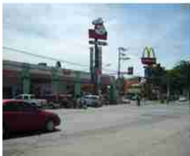
Fast Food Shop (Jollibee, McDonald)