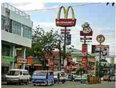
Main Street in Bacolod (Lacson)