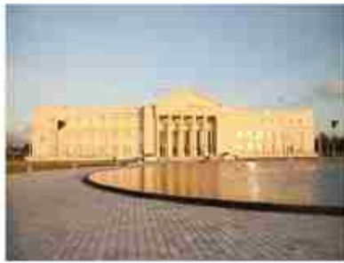
N.G.C (Bacolod New City hall)