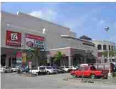
Robinson's Shopping Mall