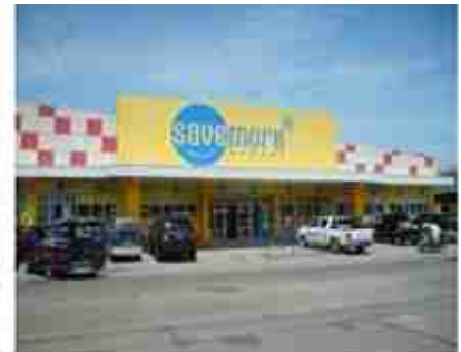
SM Supermarket (2mins on foot)