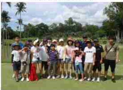
P.E. - Golf