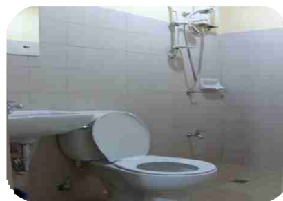
Bathroom each room