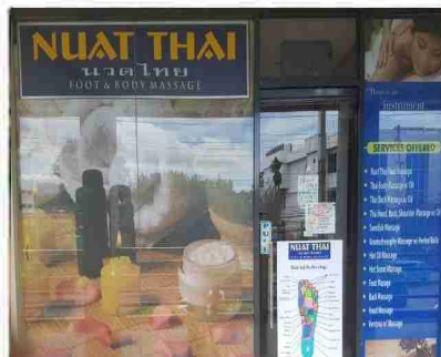
Massage shop (5mins on foot)