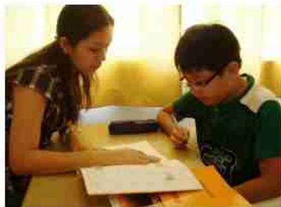
One on One Class