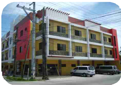
Dormitory front figure