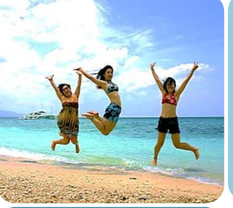
Sports Swimming pool, Badminton court Table Tennis Basketball court Etc.