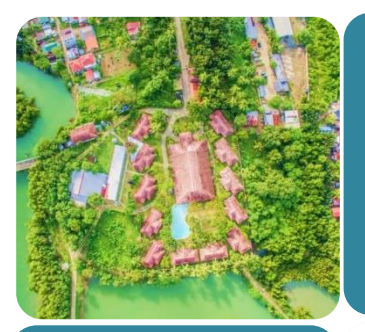
Healing Resort ELSA has a huge size dormitories, garden, p romenade, swimming pool and sports faciliti es in a 5-hectare size.