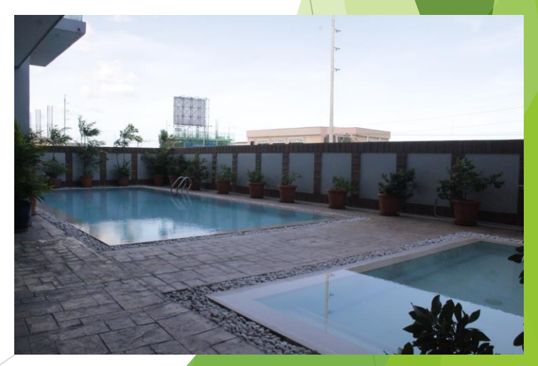
ADULT& CHILDREN SWIMMING POOL