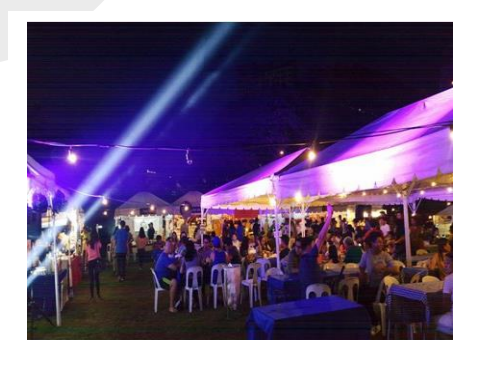
Cebu IT Park